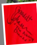
▶ Nanny Diaries umbrellas Donated by: Scarlett Johansson She used them to fly like Mary Poppins while filming.